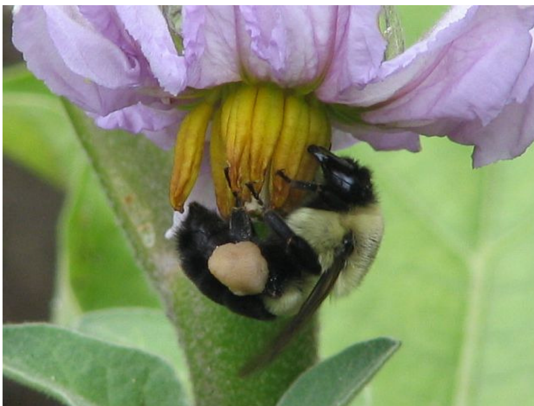
Figure 2. The development of many crops grown in community gardens benefits from pollination by bees. The common eastern bumble bee Bombus impatiens is shown here on an eggplant flower.

We calculated the incidence of each crop as the number of gardens where the crop was grown, divided by the 19 surveyed gardens. In a recent review, Klein et al. (2007) classify the benefits of animal pollination for a variety of crops. For each crop, Klein et al. (2007) classified the ‘positive impact by animal pollination’ based on the reduction in crop yield when animal pollinators are absent as follows: little - absence of animal pollinators results in 0-<10% yield reduction (as determined by reductions in seed or fruit set, seed quality or fruit weight); modest - 10-<40% reduction; great - 40-<90% reduction; essential - \geq 90\% reduction. We classified crops in community gardens not included in Klein et al. (2007) as “ important ” if they were included in Corbet et al. (1991) or Morse and Calderone (2000).