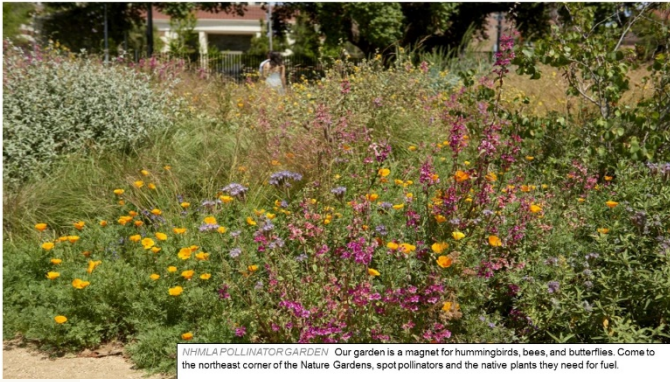
NHMLA POLLINATOR GARDEN Our garden is a magnet for hummingbirds, bees, and butterflies. Come to the northeast corner of the Nature Gardens, spot pollinators and the native plants they need for fuel.